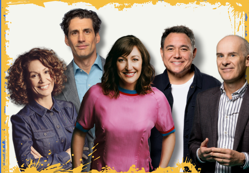
Kitty Flanagan, Andy Lee, Celia Pacquola, Sam Pang